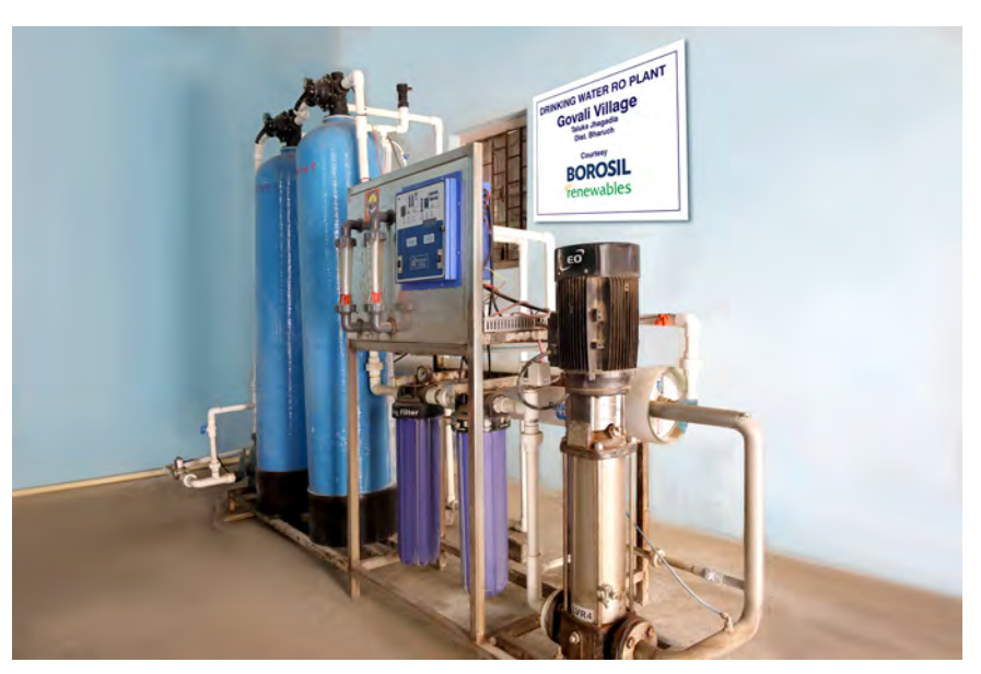
Drinking water RO plant installed in Govali village