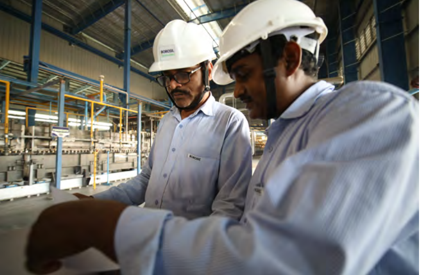
(L-R) Our talented and skilled employees ensuring class leading manufacturing operations and safety standards.