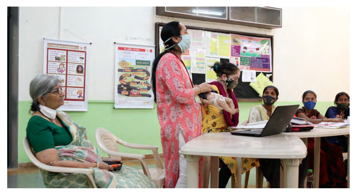
Training session being carried out to improve for one of our healthcare initiatives