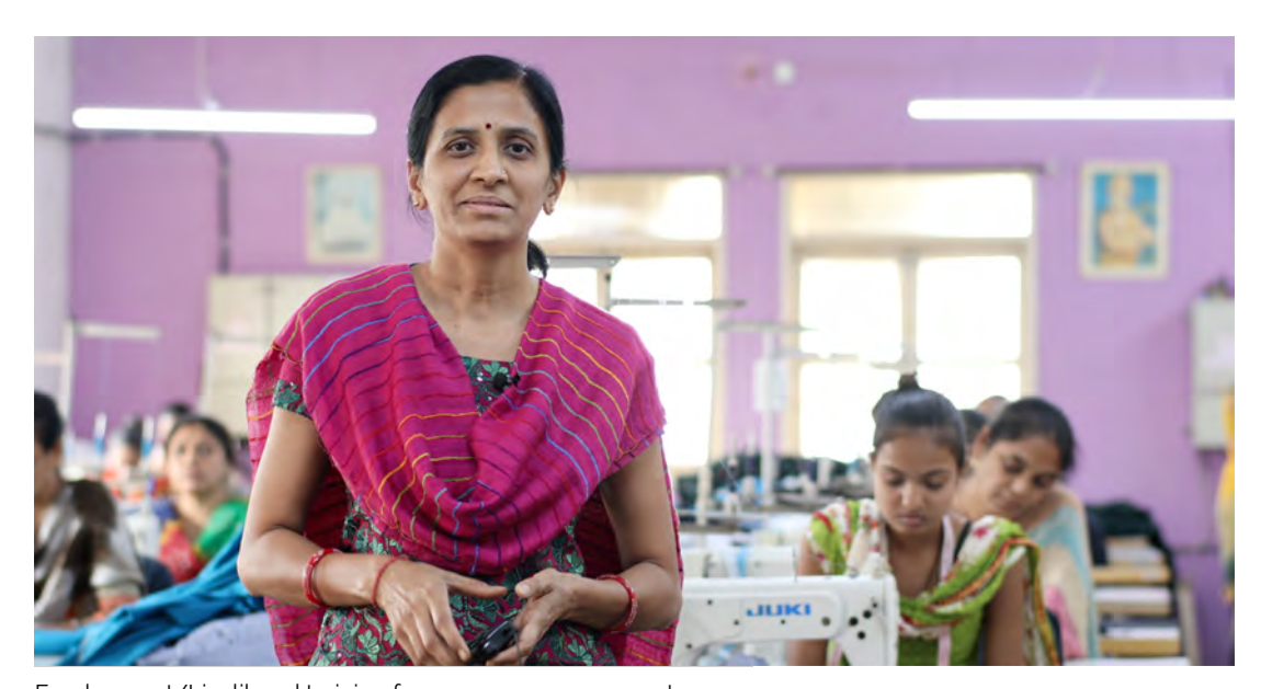
Employment/Livelihood training for women empowerment