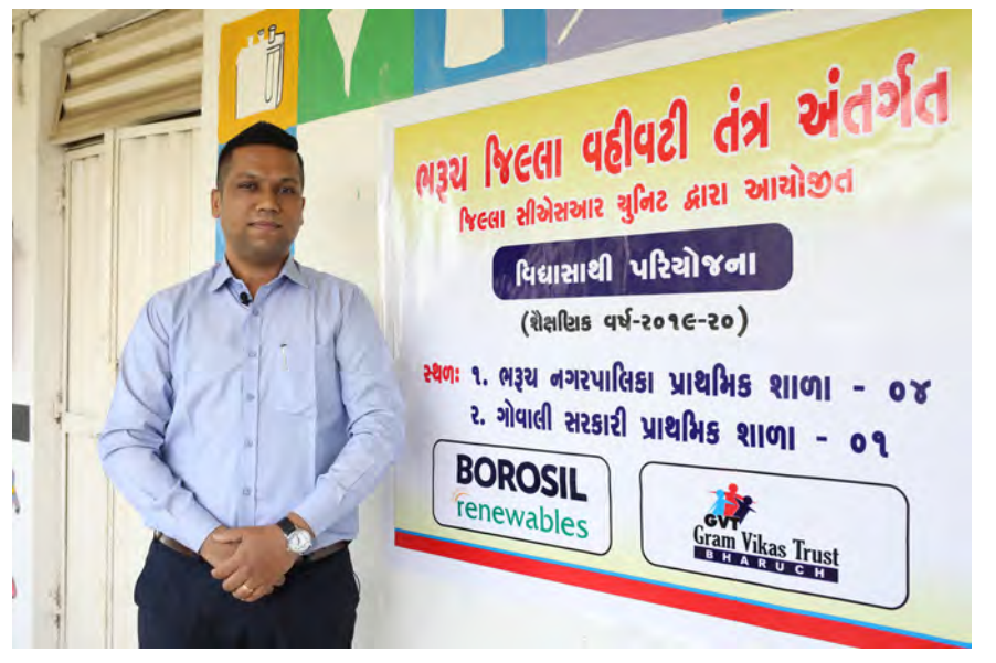
Contributed to Gram Vikas Trust for the Vidyasaathi project